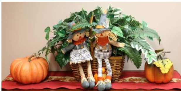
Adorable decorations at the Senior Center.