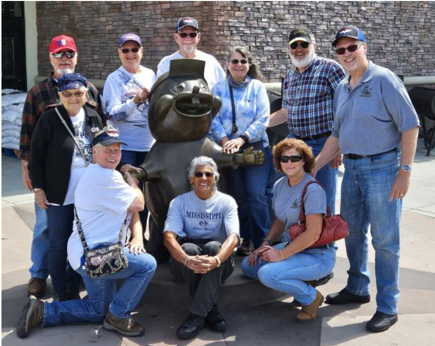
Chapter F and Chapter E2 on our way to Knoxville for the Inaugural Eagle Wings Rendezvous. Fourteen bikes/trikes with 21 people!! All proud to represent Ohio!