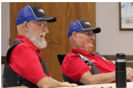
Having FUN at our September Get-together!! Celebrating 40 years of continuous FRIENDS & FRAMILY!! (The cake was awesome!)