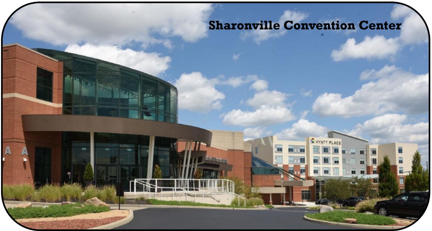
Sharonville Convention Center