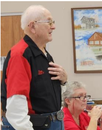
Men at work!!