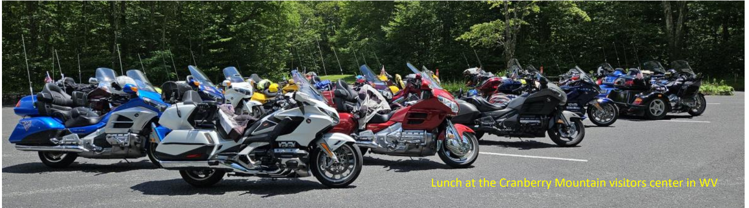
Lunch at the Cranberry Mountain visitors center in WV

JOIN EAGLE WINGS MOTOR- CYCLE ASSOCIATION WITH EASE. SCAN THE QR CODE!!